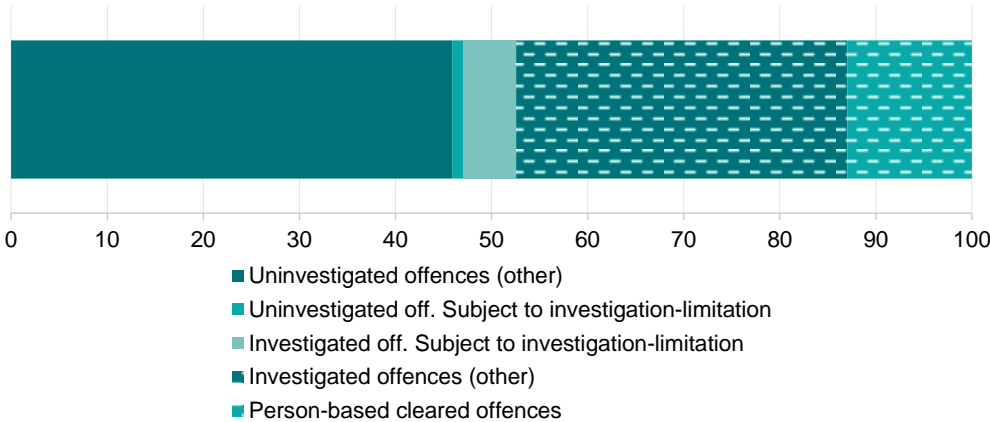
Figure 1 below reports all processed offences broken down based on the processing categories ‘investigated’ and ‘uninvestigated offences’, and the decision types ‘person-based clearances’ and ‘offences with a limited preliminary investigation’.