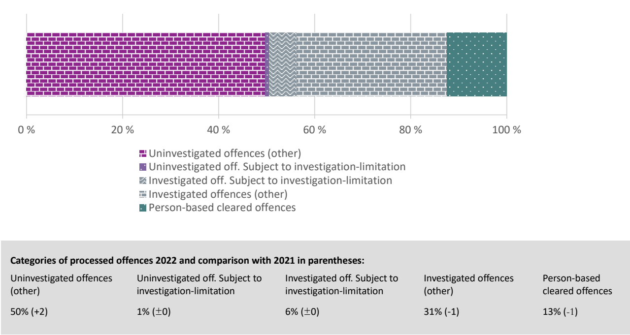
Figure 1. All processed offences for 2022 broken down based on the processing categories ‘investigated’ and ‘uninvestigated’ offences, and the decision types ‘person-based clearances’ and ‘offences subject to investigation-limitation decisions’. The parenthesis in the figure presents the comparison with the result of 2021 in percentage point.

Figure 1 below reports all processed offences broken down based on the processing categories ‘investigated’ and ‘uninvestigated offences’, and the decision types ‘person-based clearances’ and ‘offences with a limited preliminary investigation’.